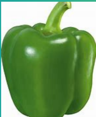
5. Green Bell Pepper