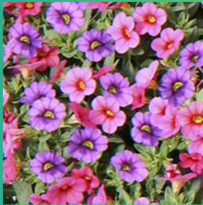
9. Calibrachoa Sun