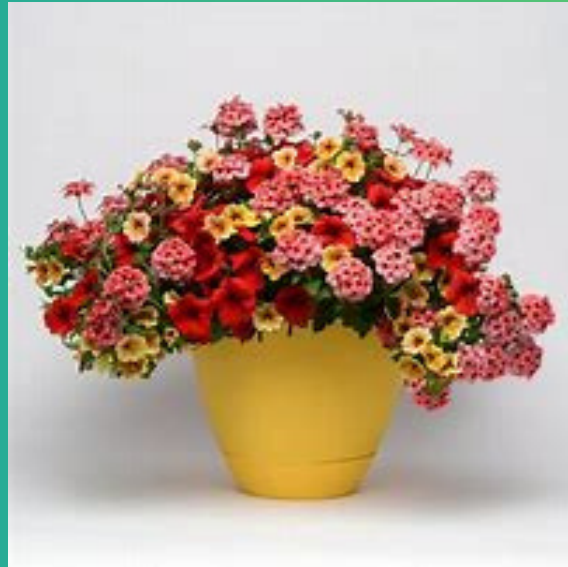
7. Asst. Combo Pot Sun