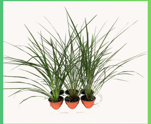
10. Spike Sun/Shade