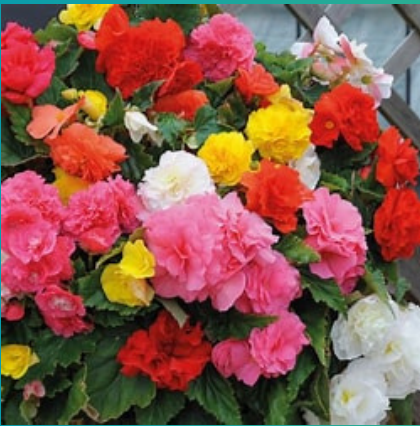
8. Begonia Shade