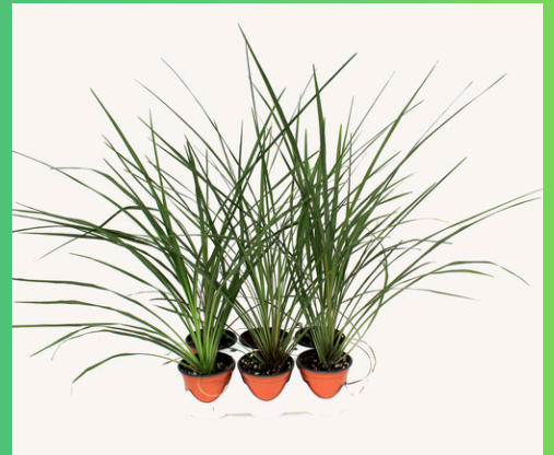
10. Spike Sun/Shade